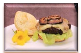
Mushroom and Swiss Burger 香菇瑞士汉堡

任选腌制墨西哥辣椒或海逸产的新鲜墨西哥辣椒，搭配安格斯牛肉饼和芝麻酸面包，抹上化开的胡椒奶酪制成我们的香辣汉堡。你可能会喜欢上它喔。