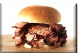
Tim's Smokehouse Original Texas BBQ Brisket Sandwich Tim 经典德克萨斯烤牛胸肉 三文治