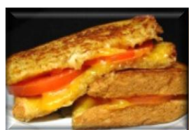
Grilled Cheese Sandwich... With a Twist 烤芝士三文治