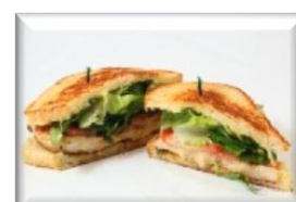
China's Finest BLT-“Bacon Lettuce and Tomato” Sandwich 中式上好培根生菜西红柿 三文治

这是一款简单而美味依旧的三文治，由荔枝木和荔枝木炭火现烤新鲜酸面包，配上精选上好马苏里拉奶酪、切达芝士，加上新鲜自产的西红柿片和墨西哥辣椒片制作而成。