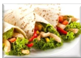
Grilled Chicken Wrap 烤鸡肉卷

这款经典三文治是专为适应本地口味而配制的，是选用湖南五花肉，精心腌制，烟熏烤制，配上西红柿片、新鲜生菜、烤酸面包制作而成。您也可以加点新鲜墨西哥辣椒片，挑战一下您的味蕾。