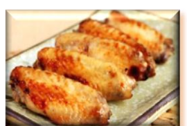
Roasted Chicken Wings 烤鸡翅

海逸版经典汉堡：由烤好的酸面包配上腌好的香菇、翻炒过的洋葱、鲜化开的瑞士芝士、安格斯牛肉饼，搭配特色牛肉酱汁制作而成。