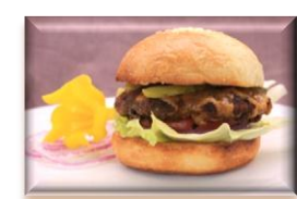
Maggie's Angus Burger Maggie 安格斯汉堡

我们精选上好澳洲牛胸肉，用荔枝木精心慢烤烹饪长达 24 小时，为您奉上最鲜嫩多汁的牛胸肉。真正的独一无二。配菜可以为您切碎或切片，也有烤酸面包和德克萨斯面包供您选择。有德克萨斯的那么“大”，也有德克萨斯的那么“好”。虽然它够大，但您可能还是会觉得吃不够。