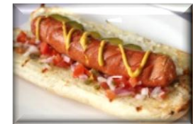
Our Original HPGC Hot Dog 海逸经典热狗

用我们独家秘制的橘酱腌制的鲜嫩多汁的鸡肉、鸡腿肉，精心烤制，配上新鲜生菜、第戎芥末、牛油果、豆芽，裹上菠菜卷，健康又美味。