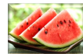
Fresh Fruit Plate 新鲜果盘

薄饼裹上炒蛋选配熏肉、火腿、牛胸肉，配上新鲜的墨西哥辣椒片、牛油果、自制辣椒酱...唤醒你的一天。