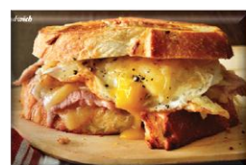
Ham and Egg Sandwich on Fresh Sourdough Bread 火腿鸡蛋三文治

烤制的英式玛芬盖上炒蛋选配烟熏培根、火腿或牛胸肉，浇上进口切达芝士。完美早晨由此开始。