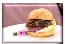
Spicy Jalapeno Burger 香辣汉堡