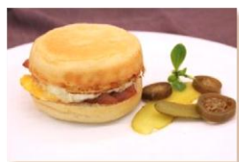
English Muffin Sunshine Breakfast 英式玛芬阳光早餐