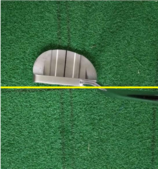
Face Open-Alignment to the Right