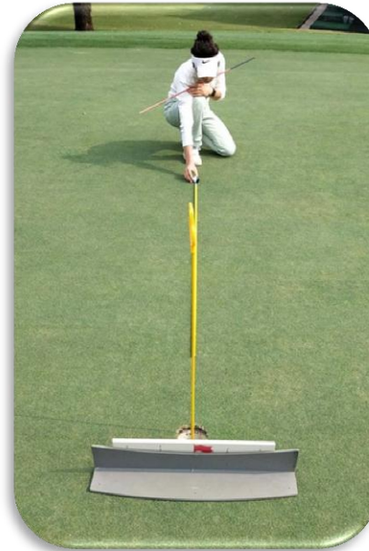
In Front of Ball