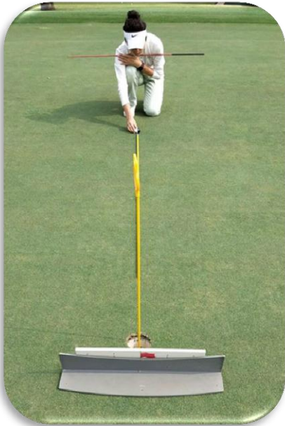
In Front of Ball